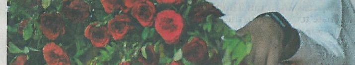
Rahul addresses a public meeting ahead of the Lok Sabha polls at Police Ground, in Rewa district, on Friday.