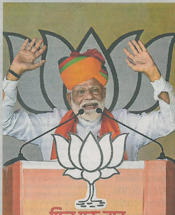
Prime Minister Narendra Modi gestures as he addresses an election rally ahead of Lok Sabha polls in Bikaner, Rajasthan, on Friday.

SIKAR — Prime Minister Narendra Modi on Friday took a dig at the Congress' claim of six surgical strikes being conducted during the UPA tenure, saying the party is now trying to prove that such military actions were also undertaken during its term, which he dismissed as "strikes carried out on paper while sitting in AC rooms". Addressing a rally in Sikar in Rajasthan, Modi said, "On Thursday, a senior Congress leader claimed that several surgical strikes were carried out during the UPA tenure. "First they (Congress) ridiculed this fact, then people started mocking them, they then protested the facts and people started protesting their claims and now they are saying 'me too, me too', trying to prove surgical strikes were also conducted during their term. "They have also brought out dates of these surgical strikes," he said. — IANS