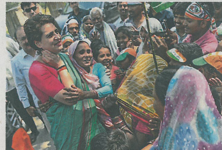
Congress leader Priyanka Gandhi during an election campaign in Raebareilly district of Uttar Pradesh on Friday.

"How many problems do you people face due to stray cattle? Have cow sheds been built as promised? When I visited Faizabad last month, our party candidate showed me a small shed that had been built only recently," Gandhi said. — IANS